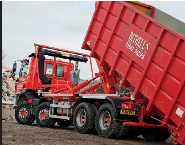
HYVA TITAN hookloaders - delivering on their promise for Bithell's Waste Disposal Ltd, Wigan